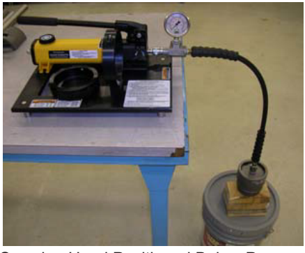
Swaging Head Positioned Below Pump