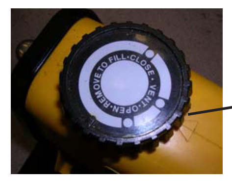
Pump Cap In Vent Position